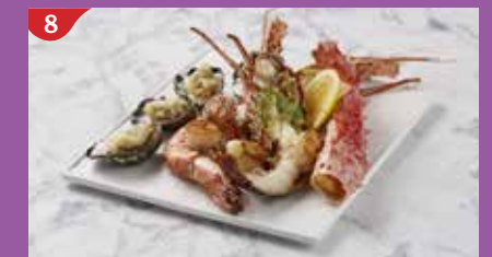
Seafood Grill (Deck 8 MID)