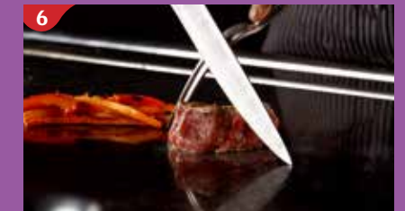
Umi Uma including Shabu Shabu & Teppanyaki (Deck 8 AFT)