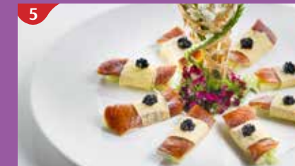
Silk Road Chinese Restaurant (Deck 6 FWD)