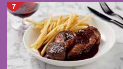
Prime Steakhouse (Deck 8 MID)