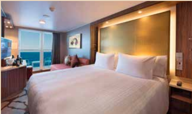
BALCONY / BALCONY DELUXE STATEROOM From 20 sq.m From 22 - 28 sq.m Max Occupancy 3 - 4 Max Occupancy 3 - 4 Deck 8/9/10/11/12/13/15 Deck 8/9/10/11/12/13/15 1 Queen-size Bed + 1 Queen-size Bed + 1 Single Sofa Bed/ 1 Single Sofa Bed/ 1 Single Sofa Bed + 1 Single Sofa Bed + 1 Ceiling Pullman Bed 1 Ceiling Pullman Bed