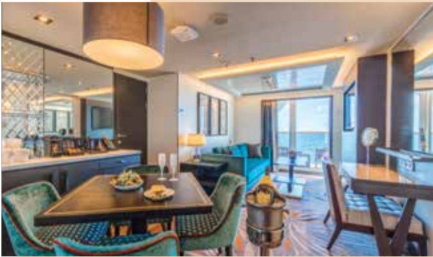
PALACE DELUXE PREMIUM From 41 - 61 sq.m | Max Occupancy 4 | Deck 9/10/11/12/13/15 1 King-size Bed + 1 Double Sofa Bed