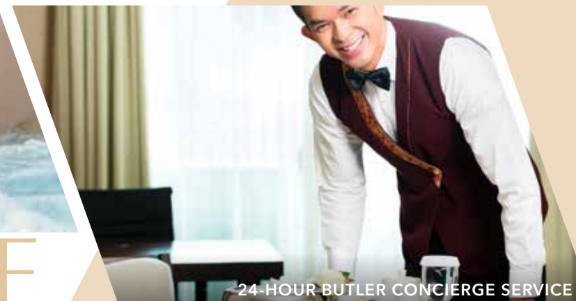
24-HOUR BUTLER CONCIERGE SERVICE