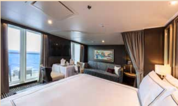
PALACE SUITE From 37 sq.m | Max Occupancy 4 | Deck 13/15/16/17 1 Queen-size Bed + 1 Double Sofa Bed