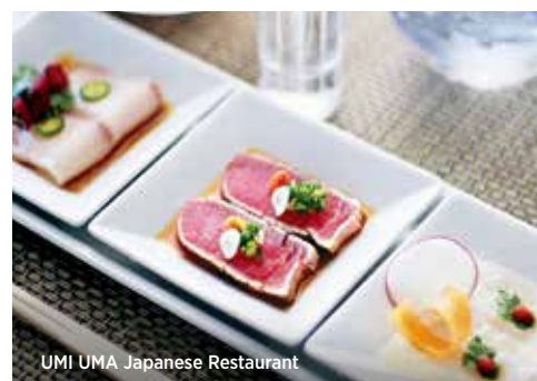
UMI UMA Japanese Restaurant